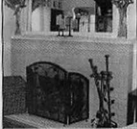
Oliver's coveted fireplace and family-heirloom mirror.

Feature I brag about: "The wood-burning fireplace. It is such a treat on a cold fall/winter night — heck, just about any night! — to sit in front of a crackling fire and have a glass of Shiraz with my husband and catch each other up on our day. The other part of the house I adore is the deck off of the kitchen. It provides us with another 400-square-feet of living space and becomes our dining room/lounge in the warmer parts of the year."